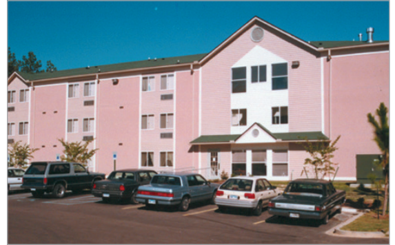
Typical One Bedroom

As a resident of Jackson Run, you will pay only 30% of your adjusted monthly income for rent. All utilities are included in the rent with the exception of telephone and cable television.